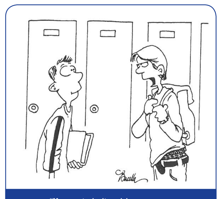
"My parents don't punish me anymore. The last time they did, I hid all the remotes."

Hutt International Boys' School, Upper Hutt: Best Use of Space Award