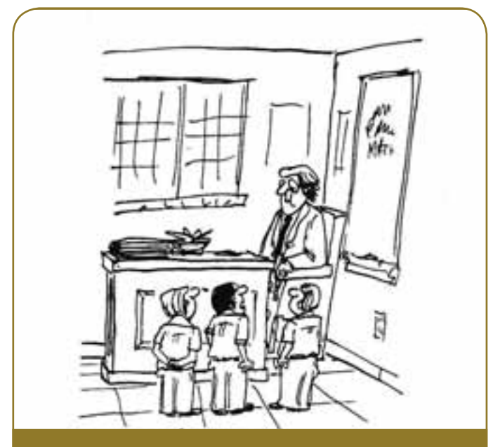
"As our math teacher, we'd like you to tell the coach it's impossible to give more than 100%."

We read a lot of integrated schools' newsletters, looking for achievements of a national level, to offer congratulations on. If you do not currently send us your newsletter, please do so, or simply send a separate email if you have something you think we could report on. Email nzceooffice@nzceo.org.nz.